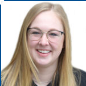
By Hannah Sweett, Ph. D.

Stay tuned for further updates on the upcoming Feed Efficiency changes as we approach the December genetic evaluation release.